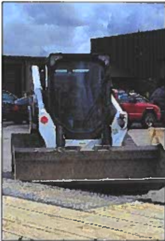
Career Exploration Workshop - Construction and Automotive

As they say, pictures are worth a thousand words, so I'll let the pictures tell the story about the great spring that I've had teaching in our county schools. It was hard to narrow the pictures down to just these!