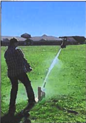
Rocketry! Cardington Middle and High School