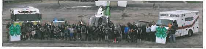
Participants, volunteers, and professionals that participated in the workshop along with the emergency vehicles and even MedFlight!