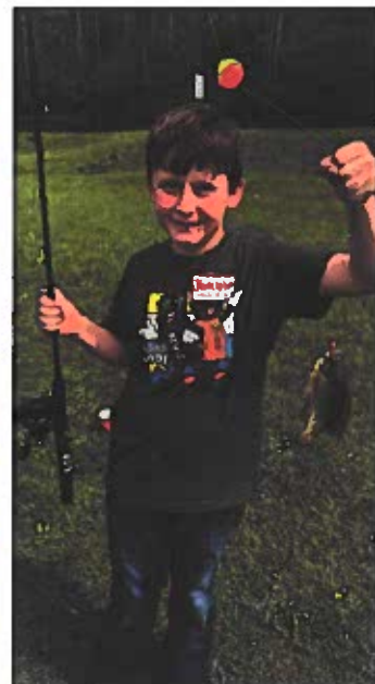
4H Fishing Day: Catching fish with their new poles!