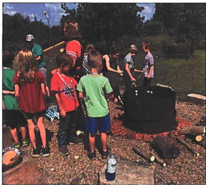
Cloverbuds enjoy cooking over a campfire at Cloverbud Day Camp