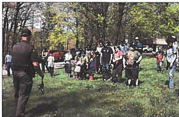
Gleaners hold 4-H Fishing Day