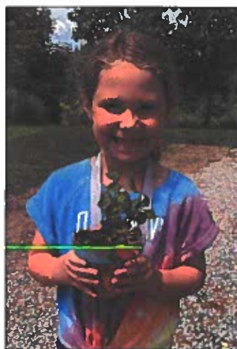
A Cloverbud shows off her potted plant from Cloverbud Day Camp.