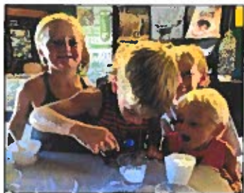
Look at the little boy's excitement as the polymer grows in the water!

Other activity topics included Identifying Wild Animals in Morrow County, Soybean Seed Necklaces – Germination, Let's Talk Chicks, Computer Coding with Meebots, and Computer Coding with Ozobots.