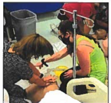
Students learn the how to perform CPR.

This workshop was a great experience for them to have in order to know if they should go into any medical field. One youth stated (that had just come to be with her friend) that after the workshop she is very interested in pursuing a job in nursing!