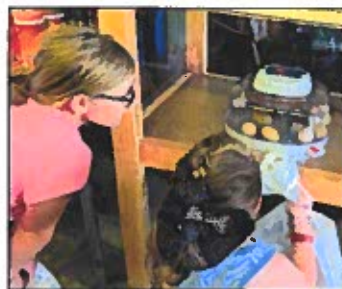
Youth wait patiently for the chicks to hatch.