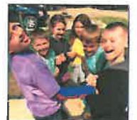
Northmor 2nd graders learning about tree needs!