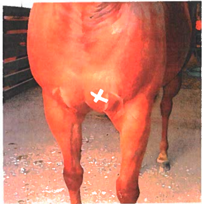
Figure 106. Chest.