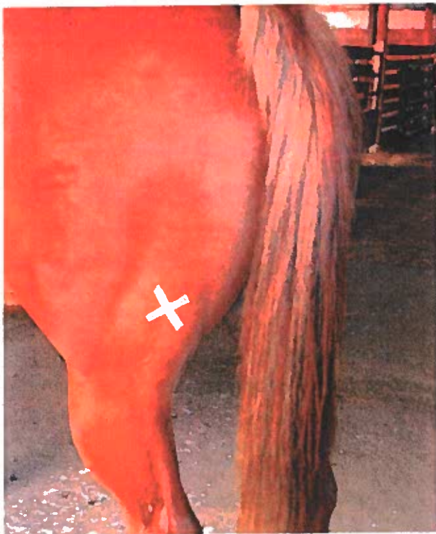
Figure 105. Butt.